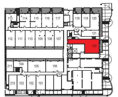
LEVEL 1 - UNIT 122

Given that the building is a historical retrofit, information and measurements are subject to change without notice. The developer reserves the right to make revisions to interior wall locations. All materials and drawing are approximate. Actual square footage may vary from the stated floor plan. All renderings are artist's concept. E. & O. E