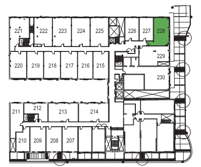
LEVEL 2 - UNIT 228

Given that the building is a historical retrofit, information and measurements are subject to change without notice. The developer reserves the right to make revisions to interior wall locations. All materials and drawing are approximate. Actual square footage may vary from the stated floor plan. All renderings are artist's concept. E. & O. E